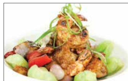
Wok Grilled Garlic Shrimp