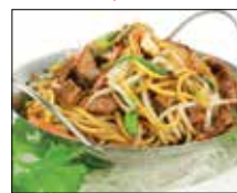
Beef Lo Mein