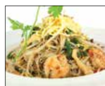
House Special Mei Fun