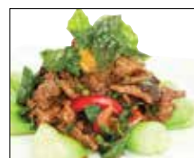
Thai Basil Steak