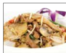
Beef Chow Fun