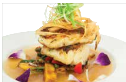
Pan Roasted Chilean Seabass