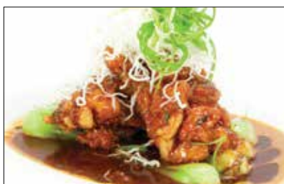
Crispy Red Snapper