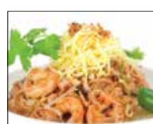
Shrimp Pad Thai