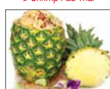
Chicken w. Pineapple Fried Rice