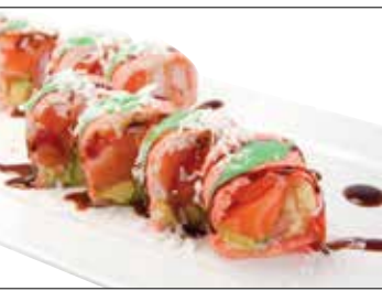
Painted Lady Roll Hadeed Roll The Yankee Roll Osaka Box Out of Control Jalapeno Yummy New York Roll Mitsui Roll