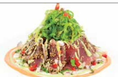
Pan-Seared Tuna w. Soba Noodle